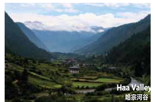
Haa Valley 哈宗河谷