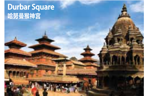
Durbar Square 哈努曼猴神宫