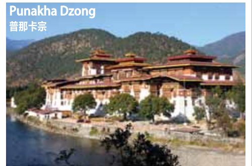
Punakha Dzong 普那卡宗