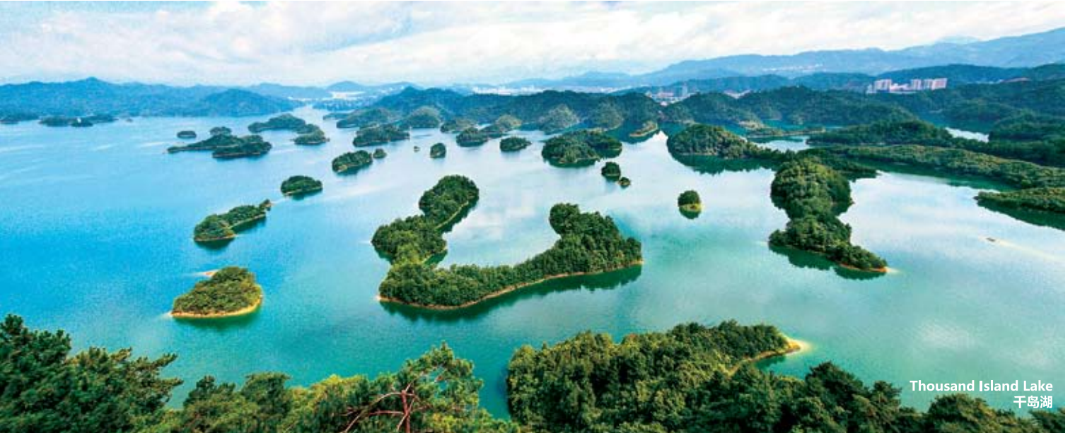
Thousand Island Lake 千岛湖