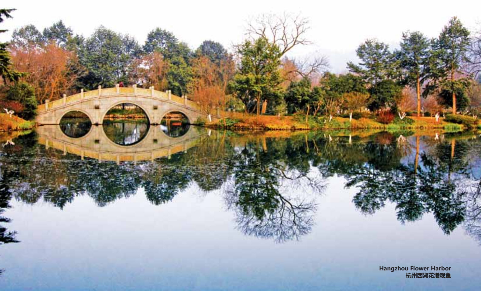
Hangzhou Flower Harbor 杭州西湖花港观鱼