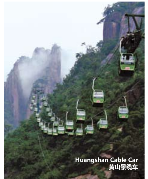
Huangshan Cable Car 黄山景缆车