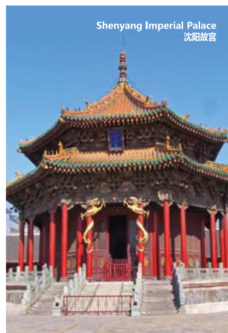
Shenyang Imperial Palace 沈阳故宫