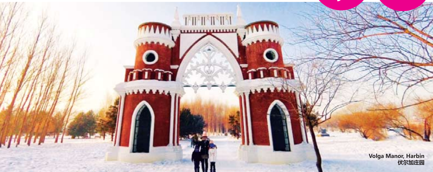
Volga Manor, Harbin 伏尔加庄园