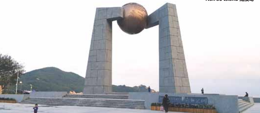
Nan'ao Island 南澳岛