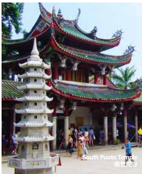
South Putuo Temple 南普陀寺