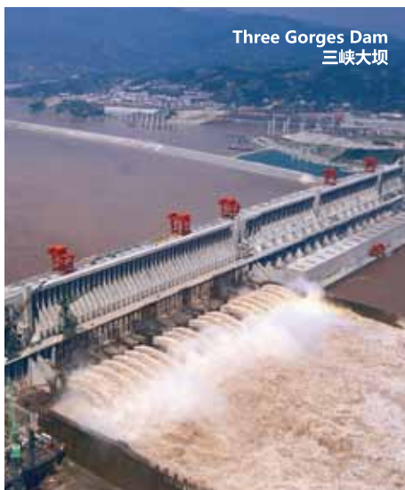
Three Gorges Dam 三峡大坝