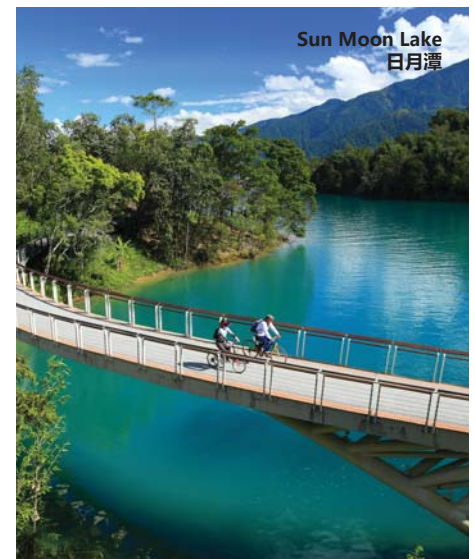
Sun Moon Lake 日月潭